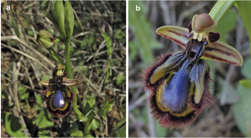
Fig. 1. Ophrys speculum Link ssp. speculum . a – habitus, b – flower.

44°46'20" E) (Fig. 2). The road passes through garrigue vegetation of the order Cisto-Ericetalia H-ić. 1958. In the first half of April only the sprouts were observed, while in the second half the plants were fully flowering. The plants were up to 10 cm high but generally in a good condition. However, the evaluation of the threat status on the national level has resulted in proposing the species as CR D (critically endangered according to criteria D). Accompanying plant species typical of the area were recorded in the close vicinity, given alphabetically in the following list: Cerastium pumilum Curtis ssp. glutinosum (Fries) Jalas,