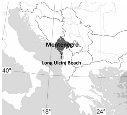
Fig. 2. Geographical position of Long Ulcinj Beach (basic map: afe_basemap, with permission of the Atlas Florae Europaea).

At approximately 12 km, Long Ulcinj Beach is the longest beach on the Adriatic coast, at the south-eastern end of which it is located (Fig. 2). This area is bordered by the channel of Port Milena to the west and the Bojana River to the east. It belongs to the wide Ulcinj plain, frequently exposed to very strong winds that carry sand from the shore inland, so sand covers a major part of the area (MIJOVIĆ 1994).