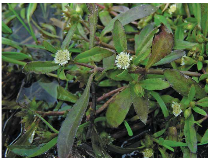
Fig. 5. Eclipta prostrata.

Eclipta is a small genus in the family Compositae (tribe Heliantheae), of which several species are distributed primarily in the New World and some in the Old World (UMEMOTO