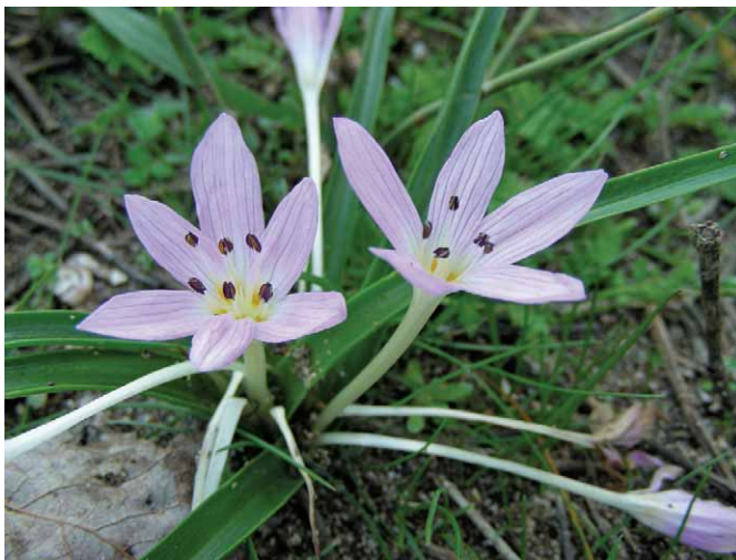
Fig. 3. Colchicum cupanii subsp. glossophyllum.

On Long Ulcinj Beach C. cupanii subsp. glossophyllum was recorded in three localities, placed in the belt transect of 1.5 km. In each case the substrate was sandy, but the habitat type differed. In the first locality (N 41° 54' 33", E 19° 15' 23.3"), four individuals of Colchicum were present. The habitat was identified as NATURA 2000 – 2270 Wooded dunes with Pinus pinea and/or Pinus pinaster . In the tree layer the dominant species were Pinus halepensis Miller. and Pinus pinaster Aiton, while in the shrub and herb layer the following species were common: Quercus coccifera L., Myrtus comminus L., Smilax aspera