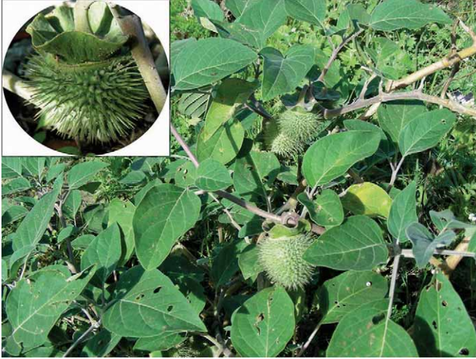
Fig. 4. Datura innoxia, habitus and fruits.

ity several alien species were present: Phytolacca americana L., Chenopodium multifidum L., Datura stramonium , Conyza albida Spreng. and Conyza canadensis (L.) Cronquist. Monitoring of this population since May 2010 to November 2012 did not show any significant invasion into the surrounding hinterland. This year another population of Datura innoxia was found in Dobre Vode, 25 km away from the first locality.