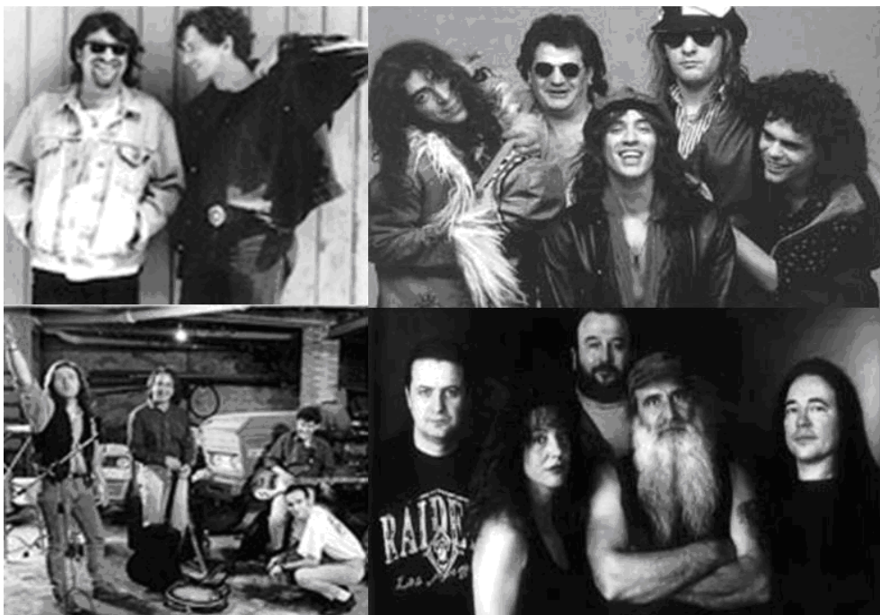
Figure 2. Sau (top left), Sopa de Cabra (top right), Els Pets (bottom left), and Sangtraït (bottom right)

Meanwhile, the Catalan public TV broadcasting corporation (CCRTV) started to air Catalan pop-rock music, but not punk-rock. Together with what has been pointed out till now, it should also be mentioned that the local cultural industry aimed to strengthen teenage fans’ phenomenon by supporting those groups that were just singing in Catalan, such as Sopa de Cabra, Sau, Els Pets, and Sangtraït (Gendrau, 2000:215).