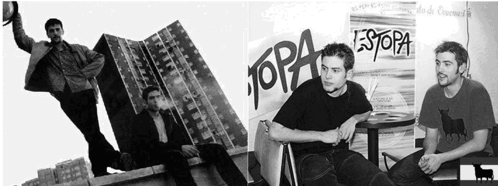
Figure 4. Estopa , a suburban rumba-rock group from Cornellà de Llobregat (Barcelona)

Note: Please note the bull printed in David's t-shirt. This has become the most commodified new Spanish fascist symbol.