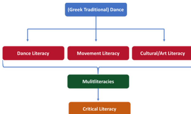
Table 2: Multiliteracies of (Greek traditional) dance

Based on the above, movement, cultural, art and dance literacy constitute the multiliteracies of dance and in particular of Greek traditional dance. The meaning of literacy concerns more and more people these days, not only in the field of education but also in society in general, specifically in the light of the values of critical literacy that contribute in the development of critical thinking of one's self and then of the world surrounding him/her. Therefore, since the individual uses his/her body to "read" and critically face his/her existence in the world, dance literacy should not be absent from the discussion on critical literacy. This discussion breaks new ground for dance per se.