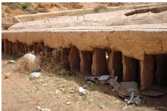
Phot. 9. Sharing system floodwaters