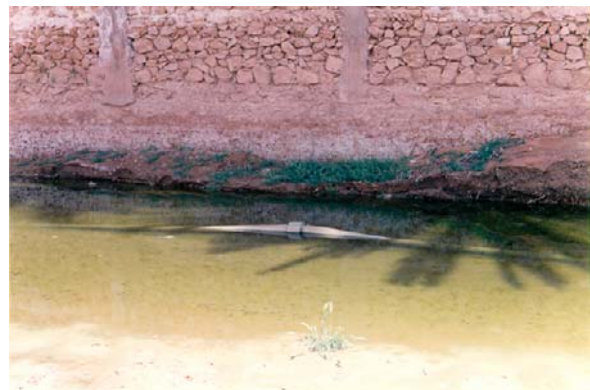
Phot. 6. Conduct of drinking water through the air zone sewage stagnation