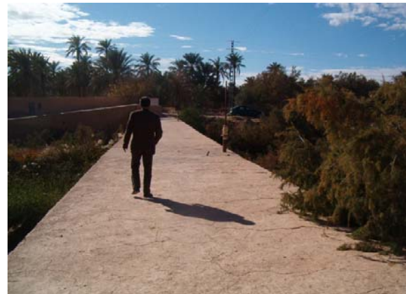
Phot. 1. Dam of Ahbas Ajdid

This is the dam the most emblematic of the M'zab valley. The dam is to cross the wadi, is based on the slope on the right bank. The dam has a spillway and a topographical closure consists of a stepped embankment on a masonry wall (Phot. 2). The main dam has suffered a major breach after the flood of 2008. Repairs and reinforcement has been made to restore its integrity. The El Atteuf dam is the last structure of M'zab River. It plays a very