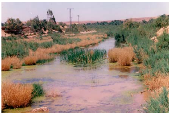
Phot. 5. Wastewater into the bed of the river, downstream of the wastewater treatment plant