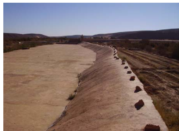
Phot. 2. El Atteuf dam