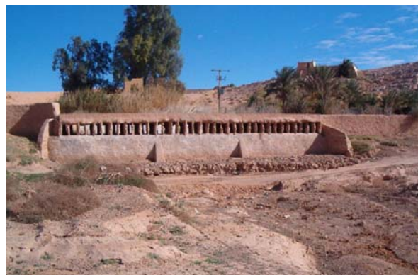
Phot. 8. Water outlet at Bouchène dam