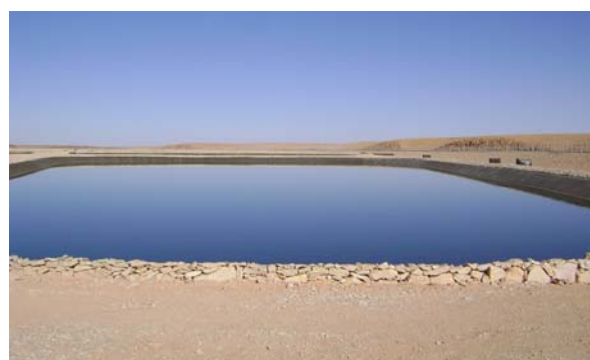
Phot. 10. A view of the water treatment plant by lagoons the M'zab Valley