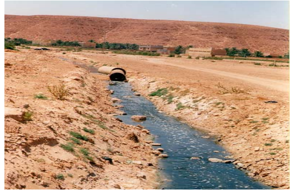
Phot. 4. Bloodletting in the bed of the river of M'zab El Atteufto channel waste water