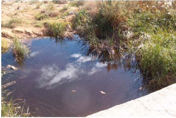
Phot. 3. Discharge of waste water into the bed of the wadi downstream Ahbass Ajdid