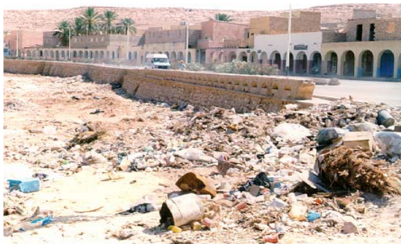
Phot. 7. Wild discharge zone in the bed of the wadi in Ghardaia