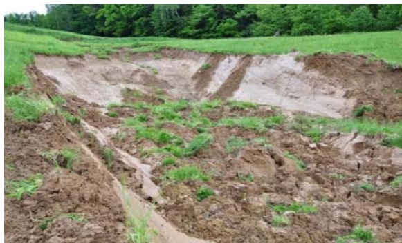
Photo 1. Landslide, Podkarpackie voivodeship, Strzyżów district

Factors which considerably limit agricultural incomes include the fragmented agrarian structure and small size of farms. This problem concerns, in particular, the South-eastern Poland [LEŃ 2010; 2011; NOGA, LEŃ 2010], the Central Poland [WÓJCIK, LEŃ