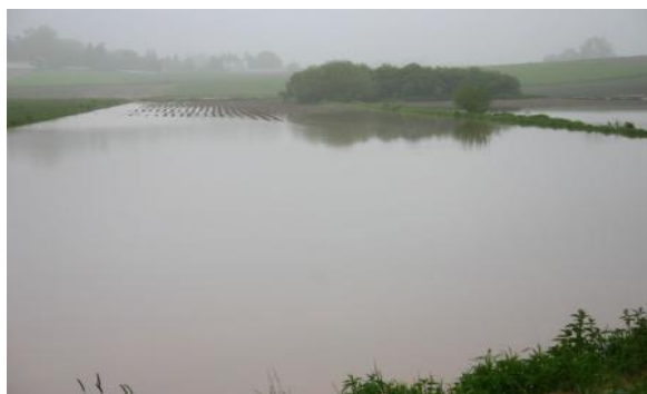
Photo 2. Flooded arable lands, Małopolska voivodeship, Miechów district; source: charsznica.info [2017]