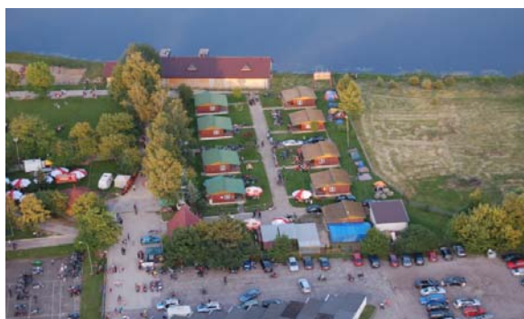
Photo 3. An example location of the recreation area, Mazovia voivodeship, Radom district, the town of Iłża