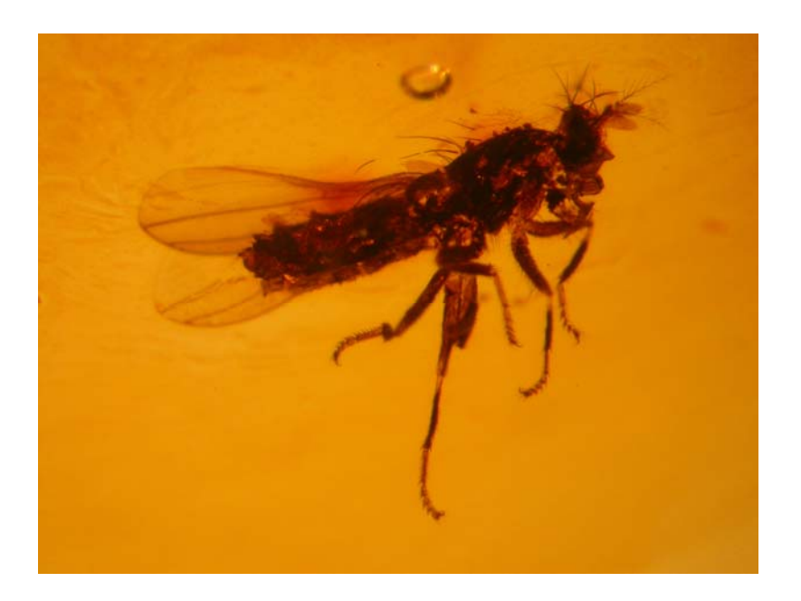
Fig. 17. Incertae sedis (Diptera, Acalyptratae), female, lateral habitus, coll. 1671-3.

The combination of plumose arista and 4 strong peristomal setae is present in Anthoclusia gephyrea within Clusiidae (HENNIG 1965) and in Procyamops succini within Periscelididae (HOFFEINS & RUNG 2005). As the other main diagnostic characters are destroyed or not discernible, placement either in Clusiidae or Periscelididae thus remains speculative.