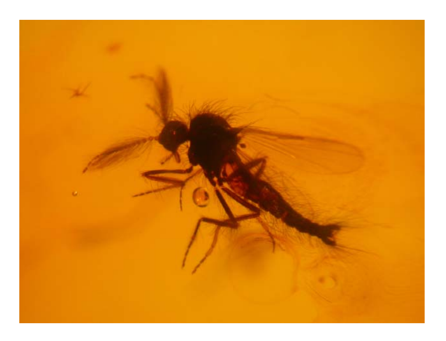
Fig. 3. Ceratopogonidae (Diptera: Nematocera), Forcipomyia sp., male, coll. 179-2.

Autoclave processing did not cause serious alterations.