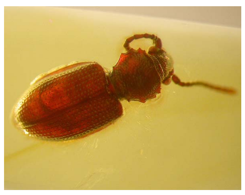
Fig. 1. Silvanidae (Coleoptera), undescribed sp., dorsal habitus, showing a vivid preservation in natural amber, coll. 1698-4.

inclusions on one side, or more or less totally and around body openings such as spiracles, terminalia and mouthparts. It is assumed that the milky emulsion is caused by the decomposition of gases or general moisture surrounding the embedded organisms, not exclusively found in insects and other arthropods but also in plants and plant debris. The phenomenon was discussed in detail by SCHLÜTER & KÜHNE (1975) and MIERZEJEWSKI (1978).