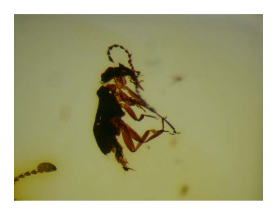
Fig. 10. cf. Pythidae (Coleoptera), roasted specimen, lateral habitus.