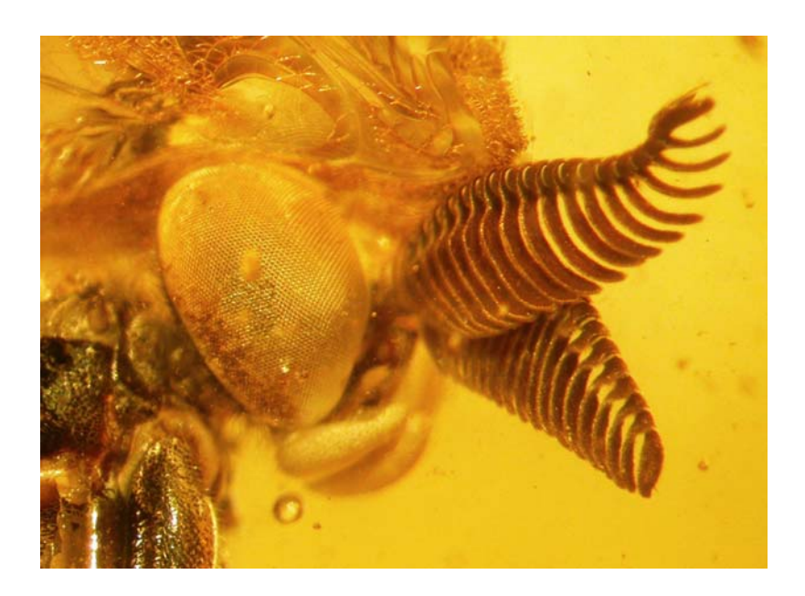
Fig. 12. Rachiceridae (Diptera, Brachycera), Electra formosa , male, head with antenna, natural amber, coll. 1104-4.