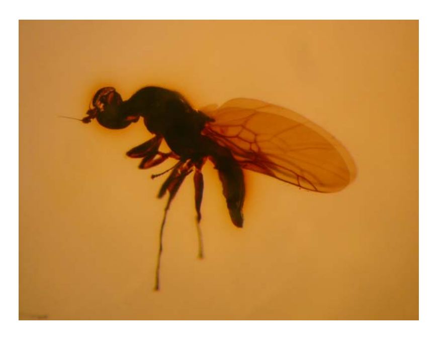
Fig. 7. Stratiomyiidae (Diptera), Pachygastrinae, autoclaved female, lateral habitus, coll. 1350-2.