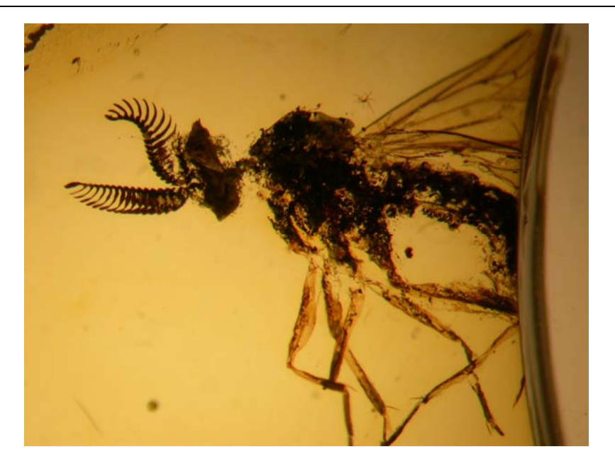
Fig. 11. Rachiceridae (Diptera), cf. Electra formosa, autoclaved ?male, habitus, coll. 1398-1.