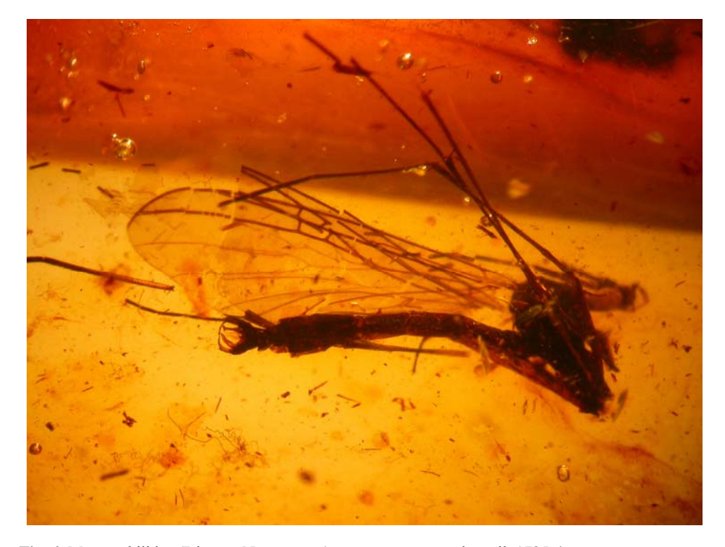
Fig. 4. Mycetophilidae (Diptera: Nematocera), Mycomyia sp., male, coll. 1735-4.

The cracks and breakages in the wing membranes and the antenna do not appear natural and most probably result from the autoclave process as wings of a recently trapped insect would still be flexible in soft resin.