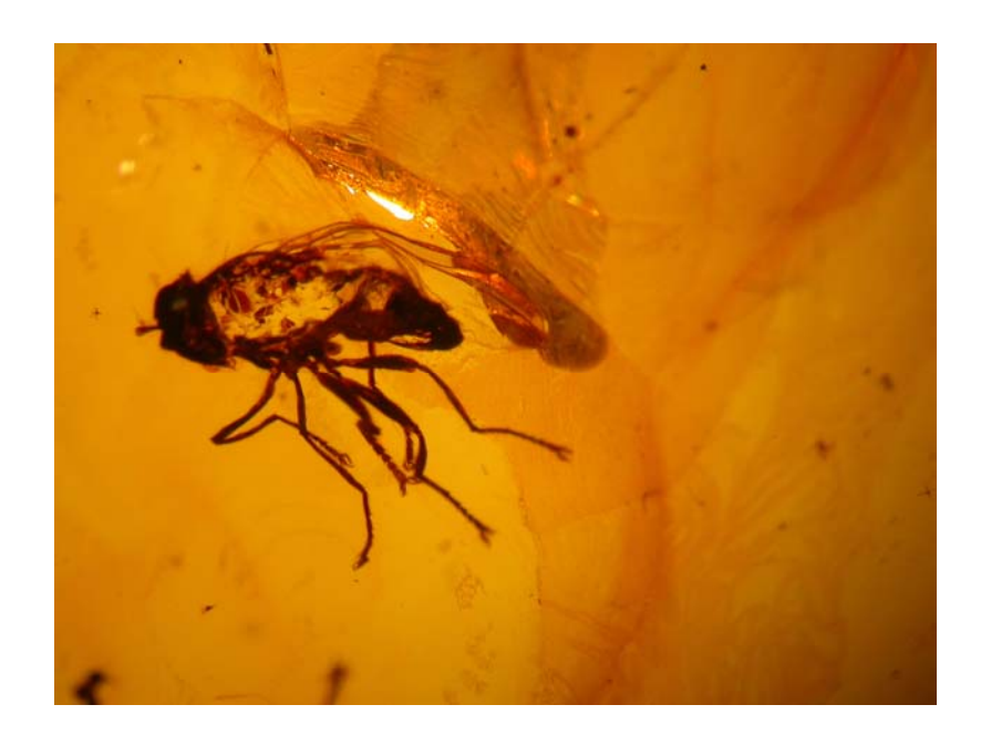
Fig. 15. Pipunculidae (Diptera), female, habitus.