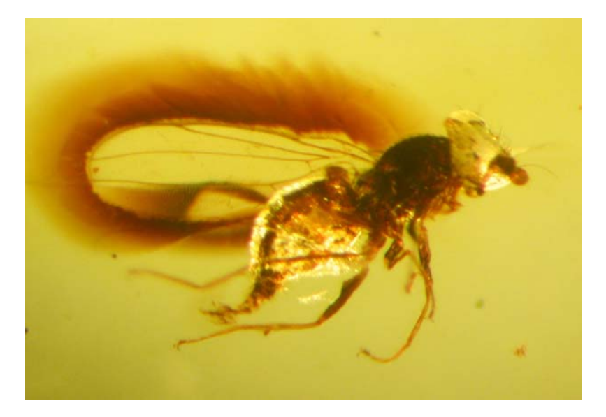
Fig. 2. cf. Asteiidae (Diptera: Acalyptratae), female, treated in an autoclave, coll. 668-4.

has to be taken into account, especially when identifying Diptera placed in the section Acalyptratae (VON TSCHIRNHAUS & HOFFEINS 2009). The integument of the legs becomes transparent so that mummified fragments are visible as thin black strings.