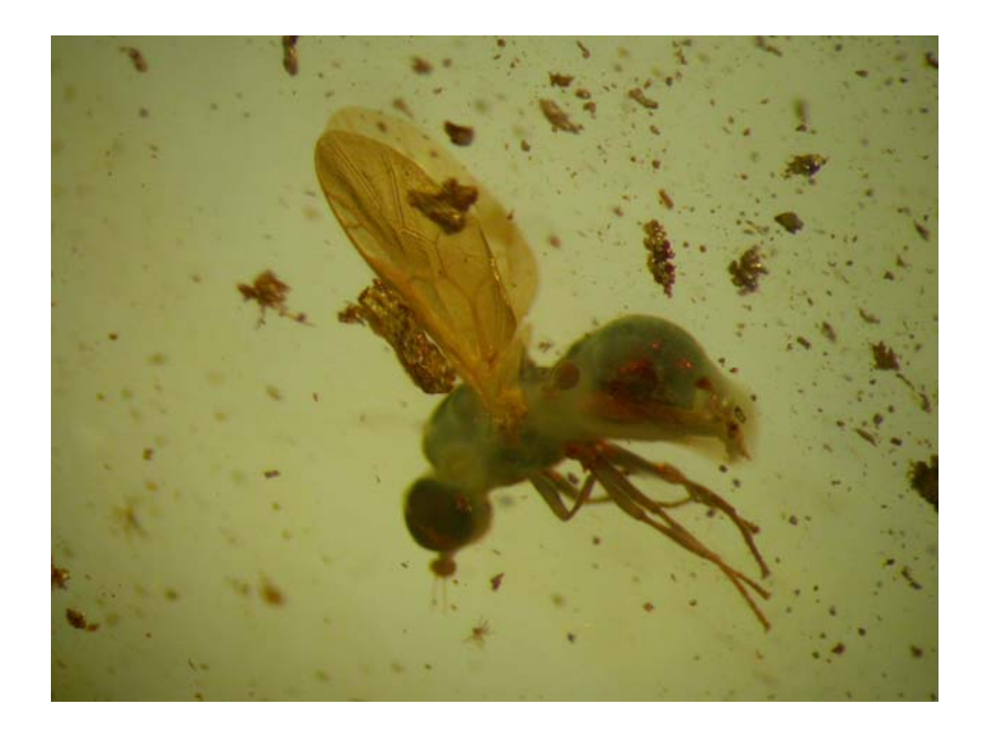
Fig. 8. Stratiomyiidae (Diptera), Pachygastrinae, female, lateral habitus, natural amber, body obscured by milky coating, coll. 1350-1.