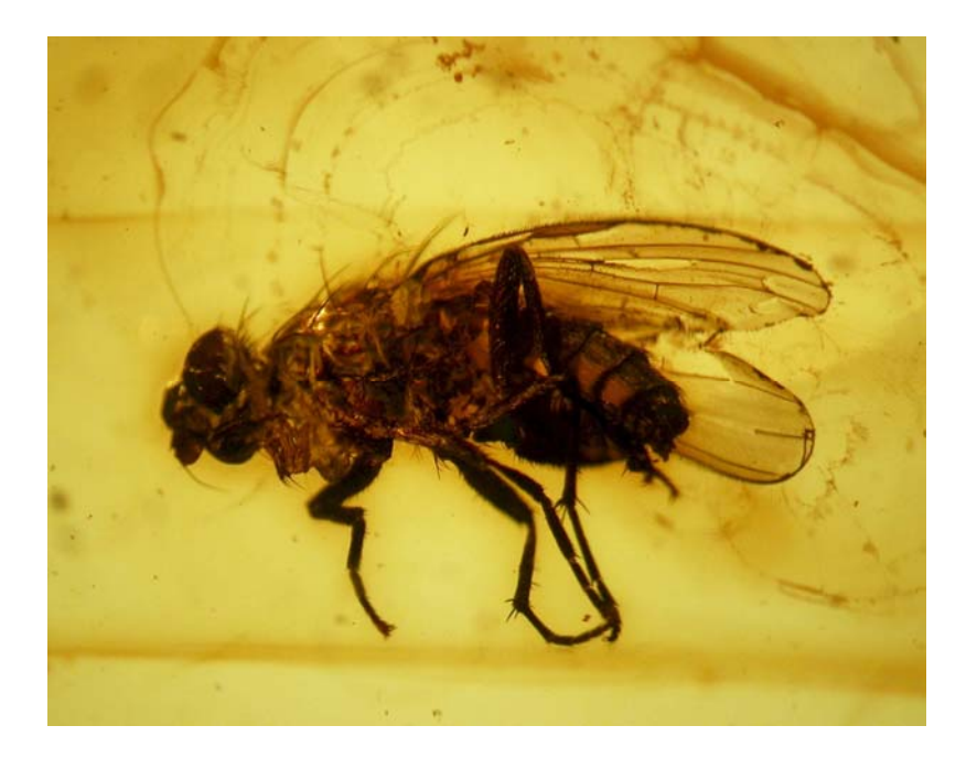
Fig. 5. Sciomyzidae (Diptera: Acalyptratae), cf. Phaeomyiinae, female, coll. 1104-4.

Next to the dipteran inclusion a minute collembola is embedded. The springtail inclusion is totally destroyed; head with eyes and abdomen disconnected from the thorax, eyes with body transparent, furca and antenna faint, diagnostic details not discernible.