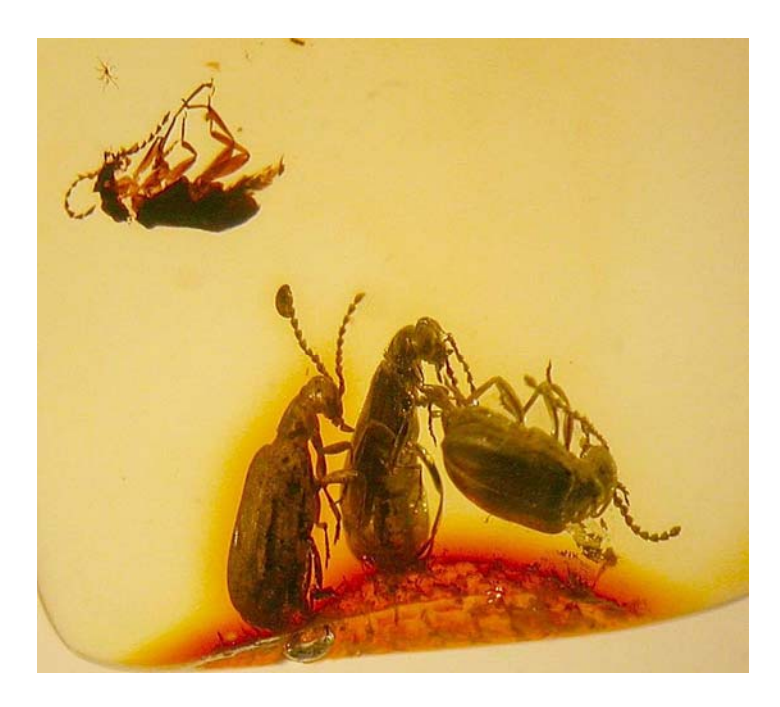
Fig. 9. cf. Pythidae (Coleoptera), 4 specimens, coll. 1588-2