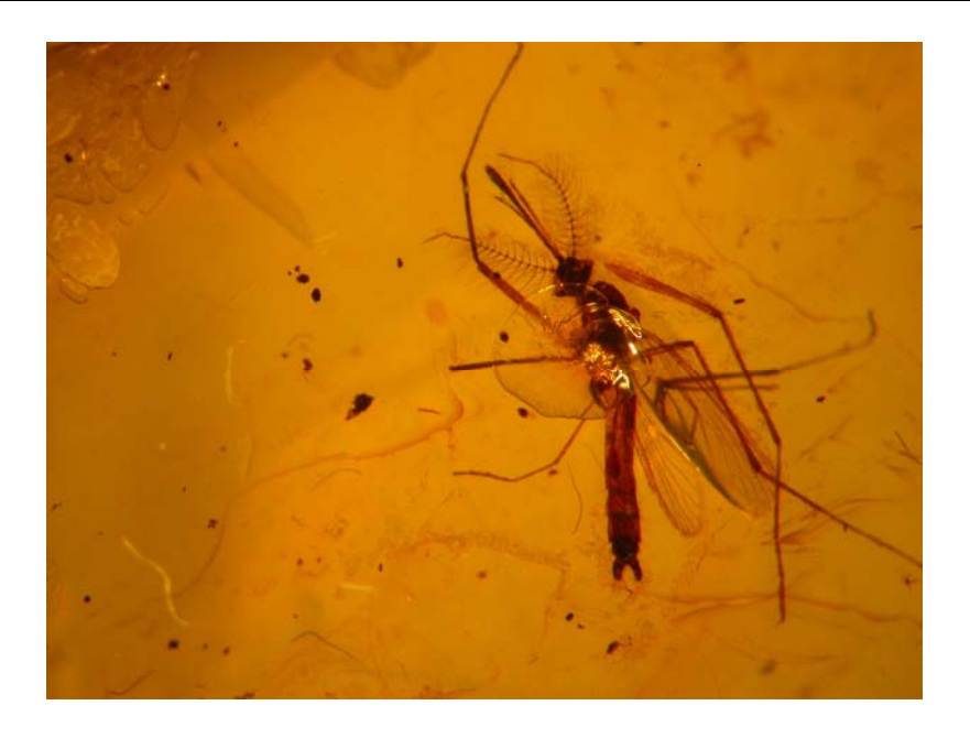
Fig. 14. Culicidae (Diptera), Aedes hoffeinsorum SZADZIEWSKI 1998, holotype male, dorsal habitus.