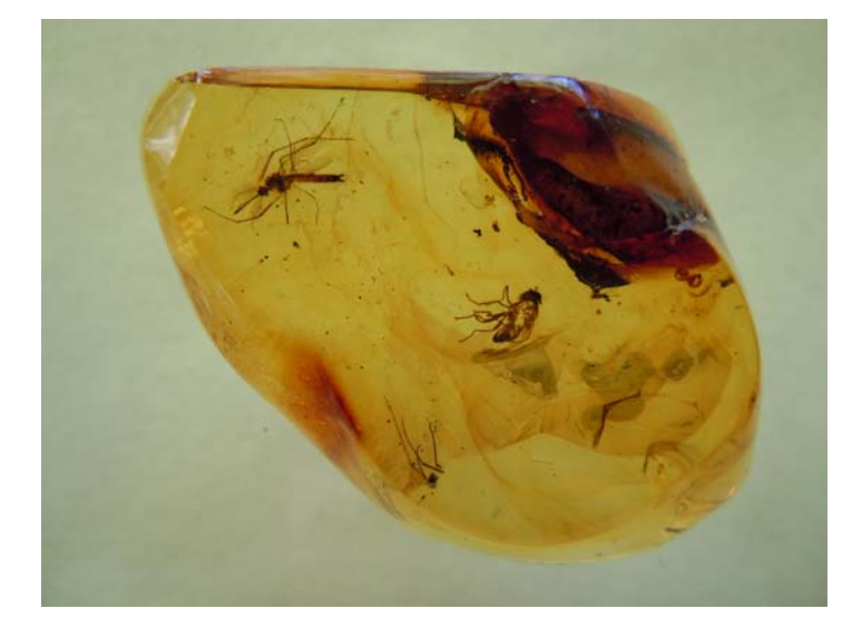
Fig. 13. Amber with Culicidae and Pipunculidae, coll. 1119.

Identification possible to family level due to the characteristic ventrally bent oviscape present exclusively in Pipunculidae.