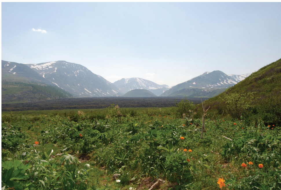
Fig. 2. Habitat of Melangyna soszynskii sp. n. in Volcano Valley.

was hovering about one metre above the ground, which was covered by grasses, Apiaceae, flowering Anemone sp. and Rhodiola sp. (Fig. 2). The whole area was covered by old lava. In most of the valley there were Betula nana and single specimens of Larix sp.