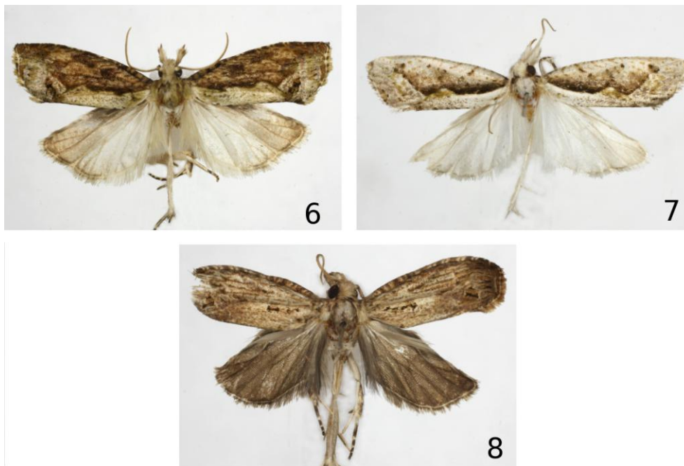
Figs 6-8. Adults: 6 – Mesochariodes armifera sp. n., holotype; 7 – M. obrimospina sp. n., holotype; 8 – M. ochyrosetaria sp. n., holotype.

Male genitalia (Fig. 1). Uncus broad, hairy, rounded posteriorly with small thorn at base of socius; the latter broad, densely setose; neck of valva long, slender with a series of six (seven in left valva) strong outer spines extending to base of cucullus; cucullus ventro-proximal; aedeagus long, slender; cornuti long.