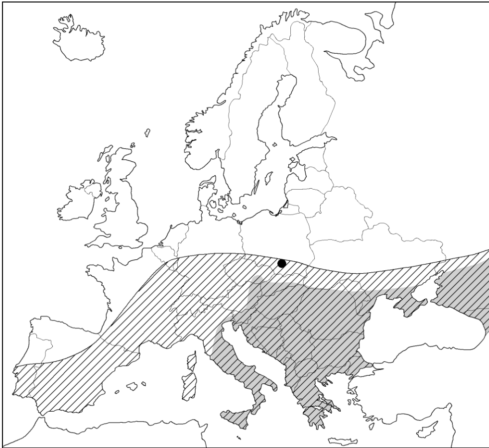
Fig. 6. A general outline of the distributions of Episema glaucina (hatched area) and E. tersa (grey) in Europe. The black dot indicates the new locality of E. glaucina in Poland.

found much farther north, in southern and central Germany, southern Poland and southern Ukraine, also to the north of the Carpathians (Fig. 6) (GAEDIKE et al. 2017, LAŠTŮVKA & LIŠKA 2011, LÖBEL & KAITER 1989, NOWACKI et al. 2018, REIPRICH & OKALI 1989, ROMANISZYN & SCHILLE 1929, ŚWIĄTKIEWICZ 1930).