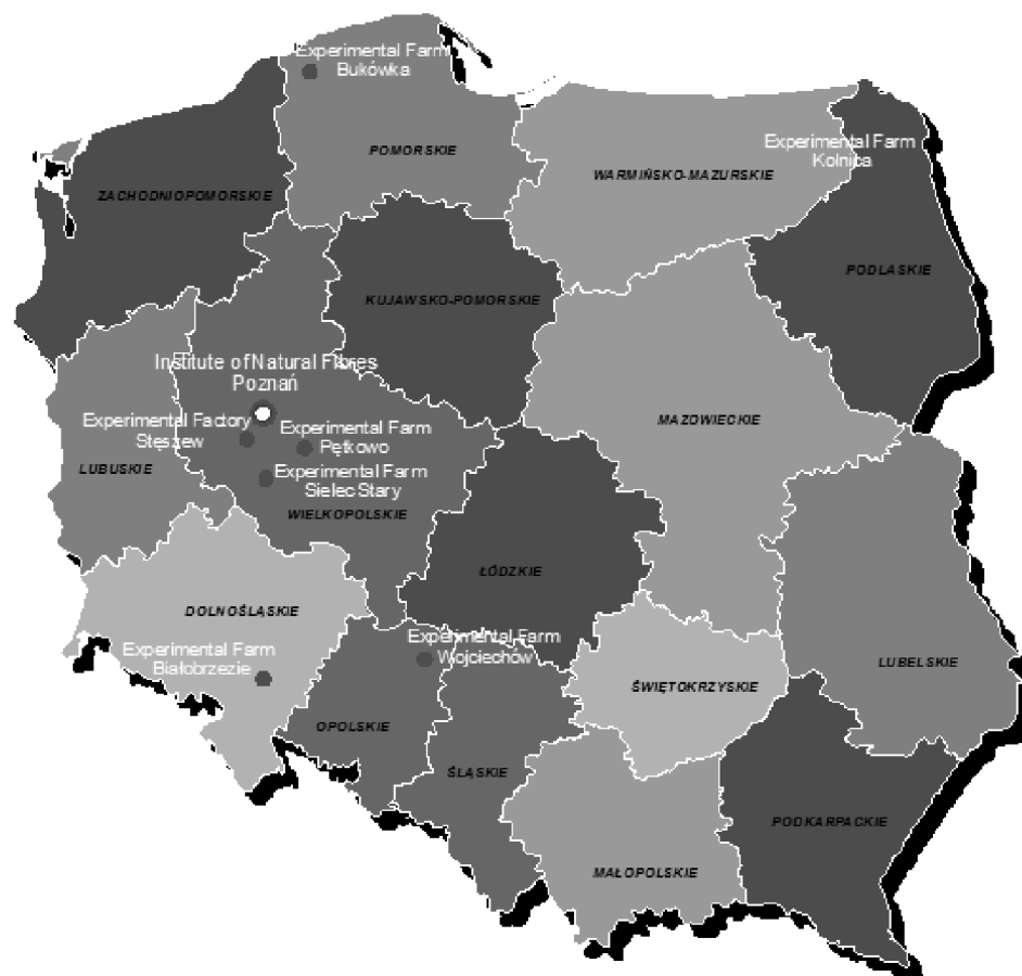
Fig. 1. Research Stations of the Institute of Natural Fibres and Medicinal Plants

Observations of weed infestation of fibrous flax in Poland have been conducted at the Institute of Natural Fibres and Medicinal Plants for over 40 years. This paper presents the results of research on changes in weed communities over the last four decades, focusing on former typical flax weed taxa, described as “flax specialists”. These taxa were common in the first half of 20 th century, described as “flax specialists” which included species like Lolium remotum Schrank, Spergula arvensis L. subsp. maxima (Weiche) O. Schwarz, Camelina alyssum (Mill.) Thell. and Cuscuta epilinum Weihe ex Boenn.