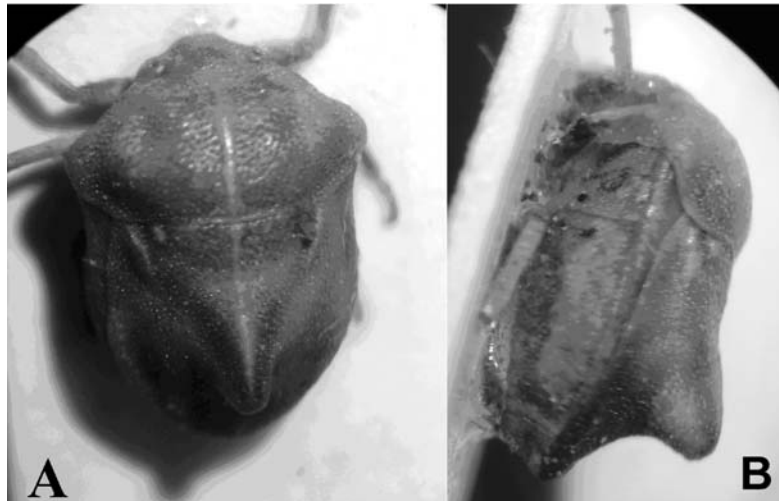
Fig. 1 - Tarisa flavescens . A, dorsal view; B, lateral view (original).

Ventocoris (Ventocoris) trigonus (Krynicky, 1871): 43 specs: 1 ♂, 10 km West of Küçükkuyu, Çanakkale reg., 10.07.2005, leg. C.P.; 1 ♂, Pehlivan köy,