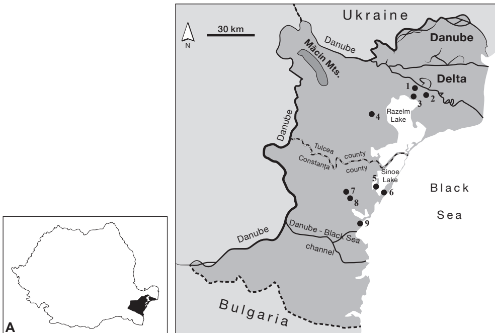
Fig. 1 - A, Location of the studied area in the Romanian territory; B, Map of localities investigated for this study in the period 2007- 2011 (numbers correspond to the localities in table 1).