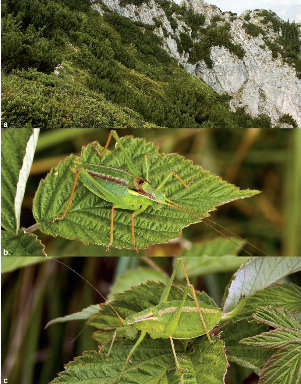
Fig. 1 - Isophya harzi : a, habitat; b, ♂; c, ♀ (Piatra Craiului Mts., 29.07.2012;).

During several expeditions in Cozia Mountains in the period 2008-2012 and one trip in Piatra Craiului Mountains in July 2012, several specimens of Isophya harzi were caught alive in order to study their acoustic behaviour. Males and females