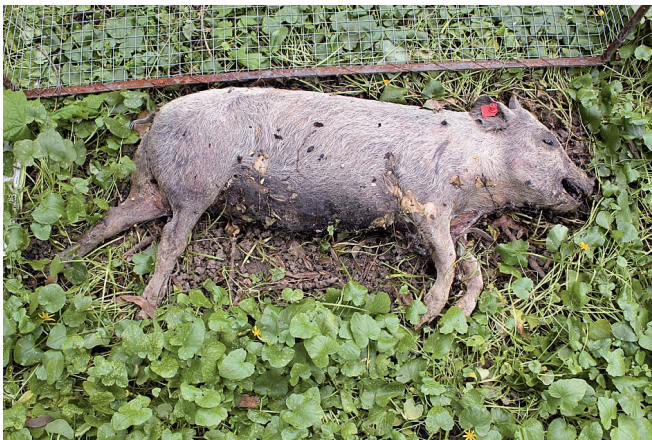
Fig. 1 - Experimental setting for T. nigricornis appearance site. Pig carcass after 5 month exposure.

T. nigricornis taxonomic identification was performed according to the taxonomic keys for this species (Pont & Meier, 2002). The identification of main