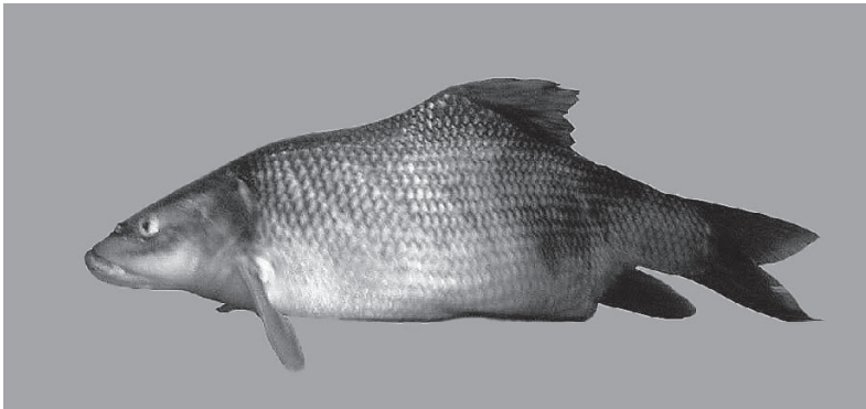
Fig. 3 - Luciobarbus xanthopterus , 598 mm total length, abnormal

Province, 350 km south of Baghdad City Capital (31°23'35.72" N, 47°38'33.04" E) (Fig. 1). Both normal specimen (Fig. 2) used for comparison and the abnormal fish (Fig. 3) came from the same area. The skeletons of both normal and abnormal specimens were prepared by boiling the fish (Fig. 4). The length of the vertebral column from the anterior margin of the first vertebra to the posterior margin of the last vertebra is divided by fish total length to produce a ratio that is used to compare abnormal fish with normal fish. Measurements for the deformed specimen are as follows: total length 585 mm, standard length 574 mm, fork length 420 mm, head length 180mm, body depth 220 mm. The vertebral column of the normal and abnormal specimens were deposited in the ichthyological collection of the Marine Science Centre, University of Basrah, Iraq.