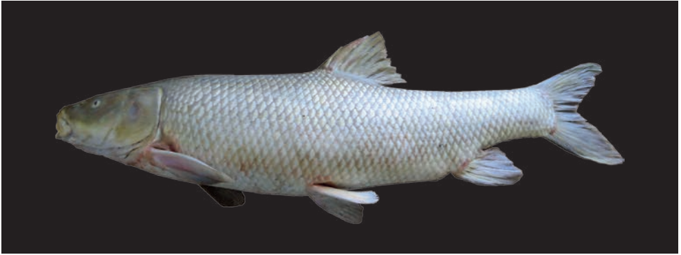
Fig. 2 - Luciobarbus xanthopterus , 585 mm total length, normal